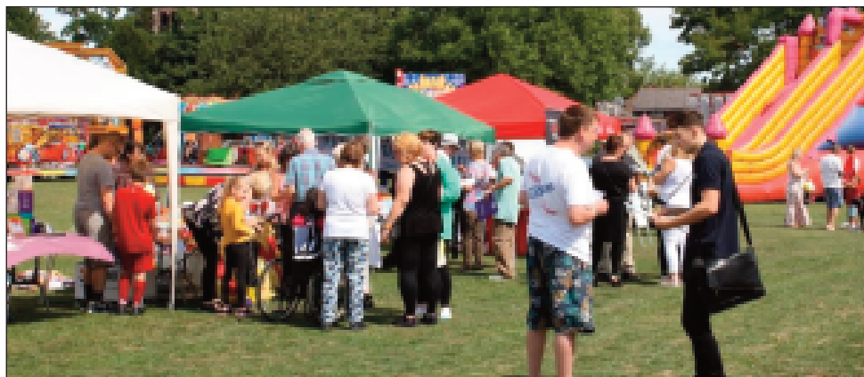
Community Fun day 2018